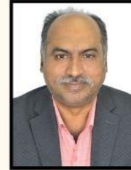
Dr. Srinivasan Ramasamy World Vegetable Center, Taiwan

Field-scale evidence for agroecological approaches: enhancing soil and plant health in Asia and Africa