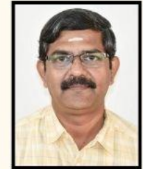
Head (Crop Production and PHT), ICAR-IISR, Kozhikode

Field-scale evidence for agroecological approaches: enhancing soil and plant health in Asia and Africa